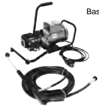
Basic Hand Carry