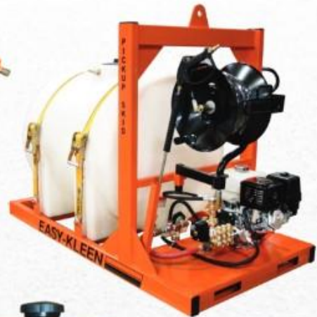
AS440GHGP/ES-SKID-225 with Pickup Skid and 225 Gallon Water Tank