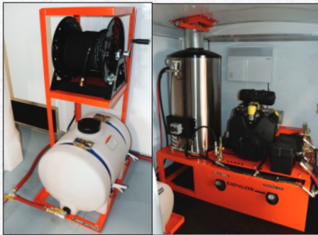
EZO3010G Grizzly Series Trailer