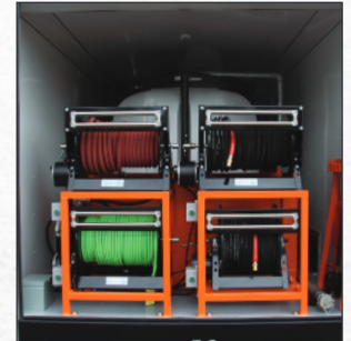
Wet Steam - Jetter & 2 x High Pressure Hose & Reels