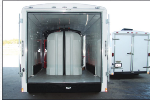
740 Gallon Water Tank