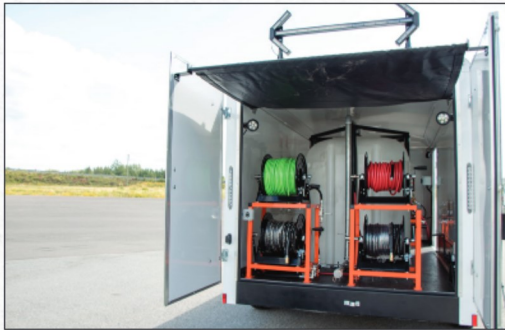
Custom Hose Reel Racks & Light Kit