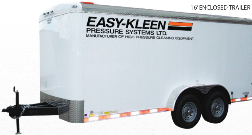
16' ENCLOSED TRAILER