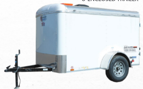
8' ENCLOSED TRAILER