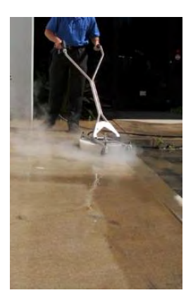
Hydro Twister® surface cleaners