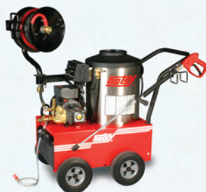
Model 555SS: 2.2 GPM @ 1300 PSI (Shown with optional Hose Reel)