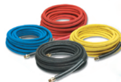
Heavy-duty high-pressure hoses in lengths up to 150-ft.

360° Pivot and non-pivot hose reels keep hose neatly stored and shop areas safe