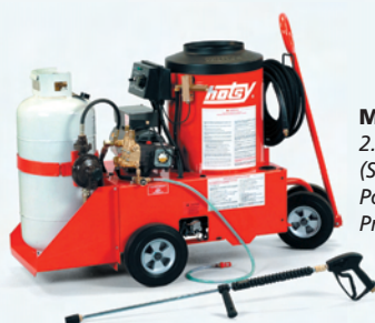
Model 558-Propane 2.2 GPM @ 1300 PSI (Shown with optional Portageur and Propane Tank)

Model 560SS: 2.1 GPM @ 1500 PSI (Shown with optional Hose Reel)