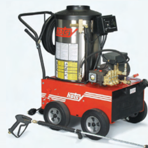
Model 680SS: 3 GPM @ 1000 PSI