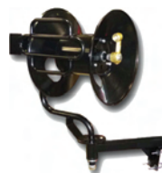
High-pressure turbo nozzles for faster cleaning

360° Pivot and non-pivot hose reels keep hose neatly stored and shop areas safe