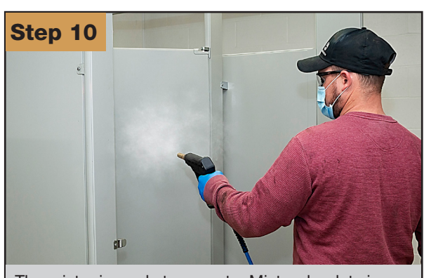
The mister is ready to operate. Mister droplet size -20-30-micron at 2-inches from tip at 350-PSI.