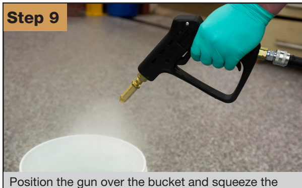
Position the gun over the bucket and squeeze the trigger. Detergent should be dispensing through