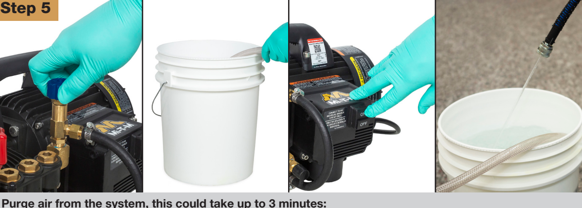
Purge air from the system, this could take up to 3 minutes: