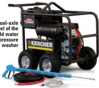
Dual-axle model of the BR cold water pressure washer

The Kärcher-Shark BR series is the most rugged cold water pressure washer on the market with two models that deliver cleaning power of up to 5000 PSI. Also in the line are four dual-axle models, including one model that is powered by a 10 HP Lombardini diesel engine.