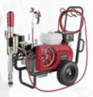
PowrTwin 12000 Plus DI

With multi-gun support and an efficient direct immersion siphon system capable of spraying very heavy coatings like drywall compound and elastomerics, these are the most powerful portable sprayers on the market today.