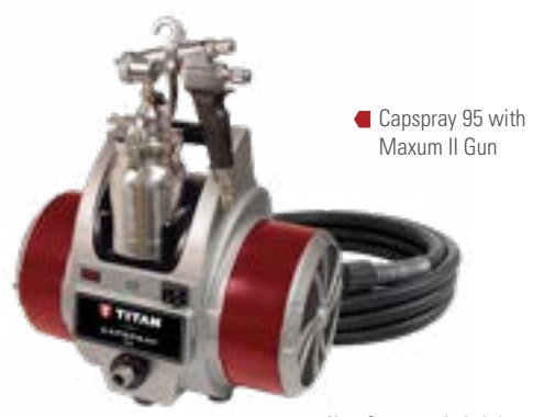
Note: Capspray units include one (1) Titan HVLP gun.

Extend the life of your turbine and maintain maximum performance with clean filters.