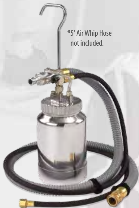
*5' Air Whip Hose not included.