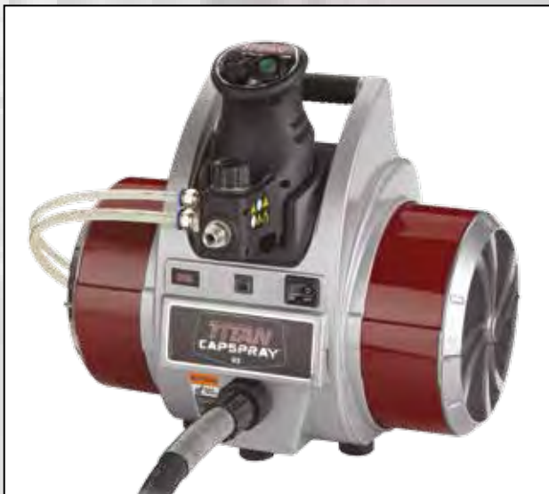
Turbine sold separately.